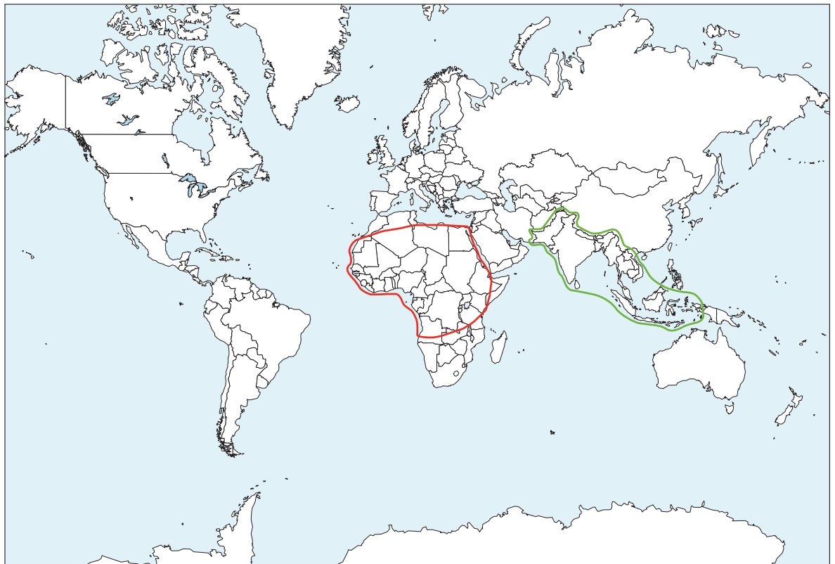
Figure 1: Estimated distribution of Zika virus before 2007

In 2007, in the first identified transmission of Zika virus in people outside Africa and Asia, in Yap State 49 people with confirmed and 59 with probable Zika virus infection were identified by combined genetic and serological analysis. 12,13 A further 72 people were defined as suspected cases, and five did not have Zika virus infection. 12 Findings from initial laboratory testing with a commercially available dengue IgM assay suggested that dengue virus was the causative pathogen, 12 although local clinicians thought the disease was different clinically from dengue fever (as reported in 12,43 ), a disease that had previously occurred in Yap State. 44,45 Therefore, final diagnosis was based on more detailed serological