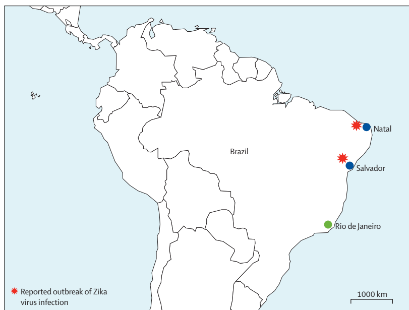
Figure 3: Introduction of Zika virus to Brazil

Since the first reported cases, 80,81 an estimated 440 000 to 1 300 000 Zika virus infections have occurred in Brazil, 3 and the virus has spread to several neighbouring countries. In a rapid risk assessment produced by the European Centre for Disease Prevention and Control, 83 and drawing on several non-peer-reviewed sources, ongoing Zika virus outbreaks were identified in Colombia, Paraguay, Venezuela, Suriname, French Guiana, Ecuador, Guyana, and Bolivia in South America;